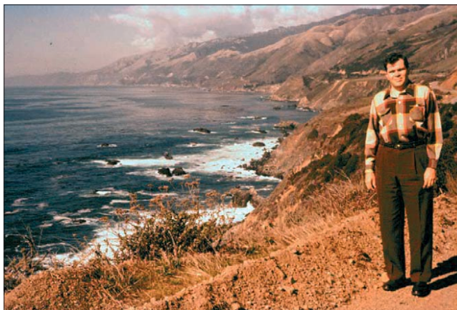
Figure 1. The sea cliffs off Highway 1 near Santa Barbara, California, where Barrow studied the regional geology and mapped the outcrops in 1955-56.

I can vividly recall those field trips as a young kid in which they would regularly point out exposed geologic structures and explain what they were and their signifi-